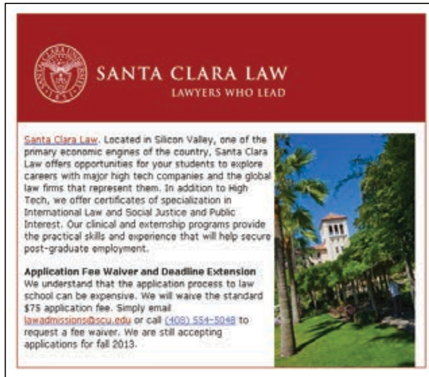
A recent message from SCU Admissions waives application fees and extends the enrollment deadline

Most schools are being forced to reduce enrollment. Schools that choose to lower admissions standards will be dramatically punished by the U.S. World